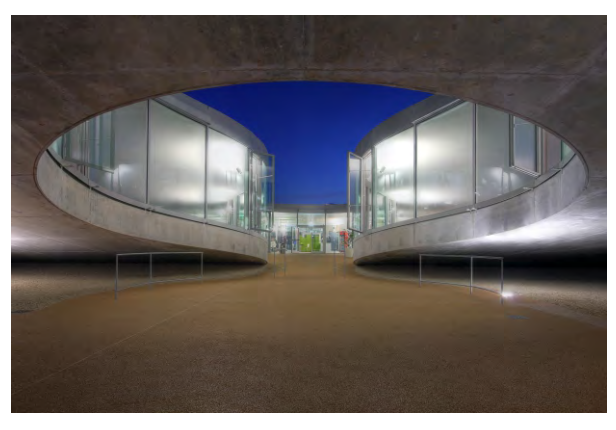
Rolex Learning Centre at the Swiss Federal Institute of Technology (EPFL)

We are always trying to improve the scholarship application process. As per my comments last year we are now charging