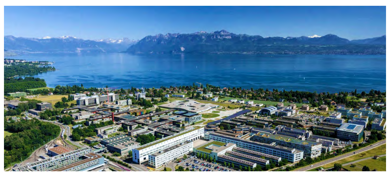
Swiss Federal Institute of Technology (EPFL) campus near Lake Geneva