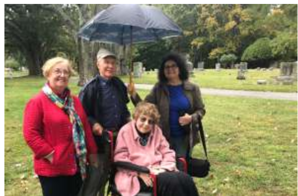
Oakwood Cemetery, Mt. Kisco, NY