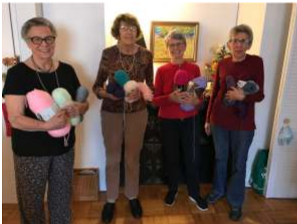
The SBS Knitting for a Cause Volunteers

The Knitting for a Cause group delivered hats and scarves to a non-profit group called Hour Children and the SBS sponsored a "Learn about Switzerland Day" for the same children.