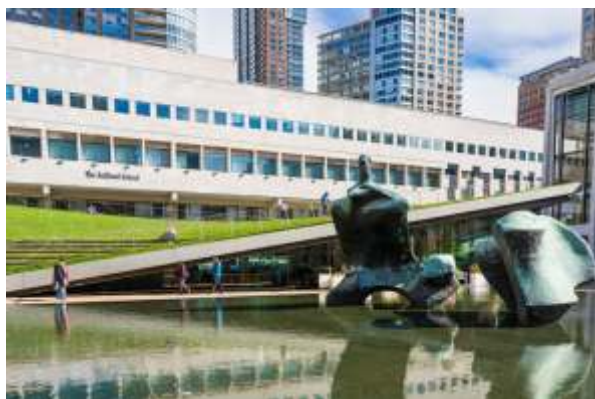
The Juilliard School, New York City

In October, we made our annual visit to the Oakwood Cemetery in Mt. Kisco at the Swiss plot. The work on the columbarium is nearing the end and a clearer picture can be