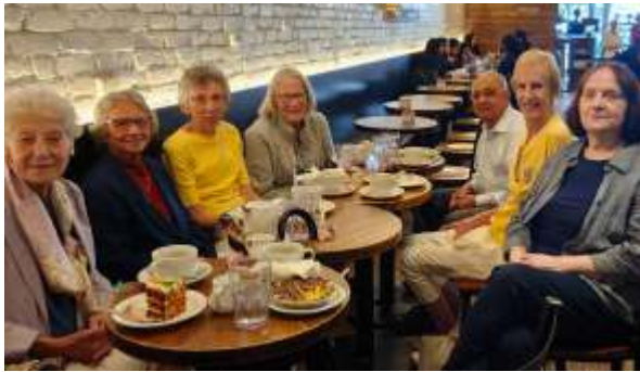
Coffee & Cake at Martha's Bakery in Forest Hills, in Queens

In 2023, while keeping many of the changes instituted during the first COVID years, we were able to schedule more home visits (over 50 visits), more hospital and nursing home visits (we were now allowed in), some outside activities, and small citywide trips. An important aspect of our activities was